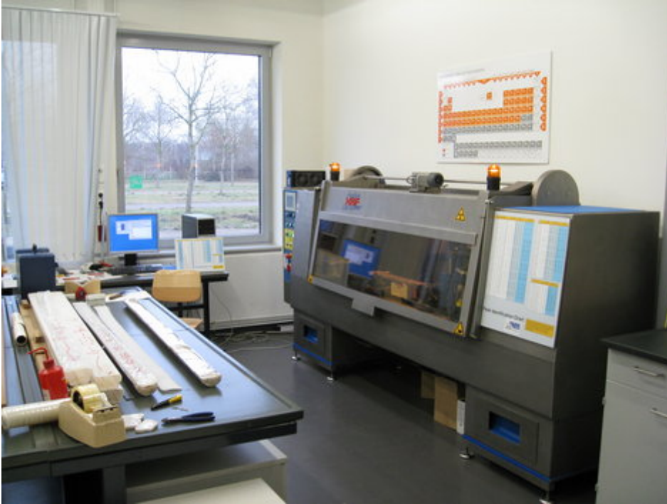
XRF Core Scanners