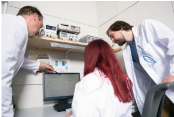
Calibration wind tunnel 3