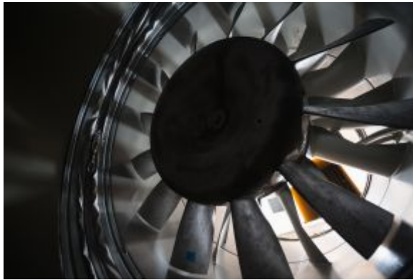
Calibration wind tunnel 1

All of our wind tunnels are of the Göttingen-type (closed circuit, total length 38m). Measurements can be performed using both open and closed test sections. The test section measures 1m x 1m x 1.8m, and is ideal for the precise measurement of wind measurement sensors.