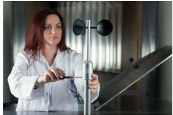
Calibration wind tunnel 4