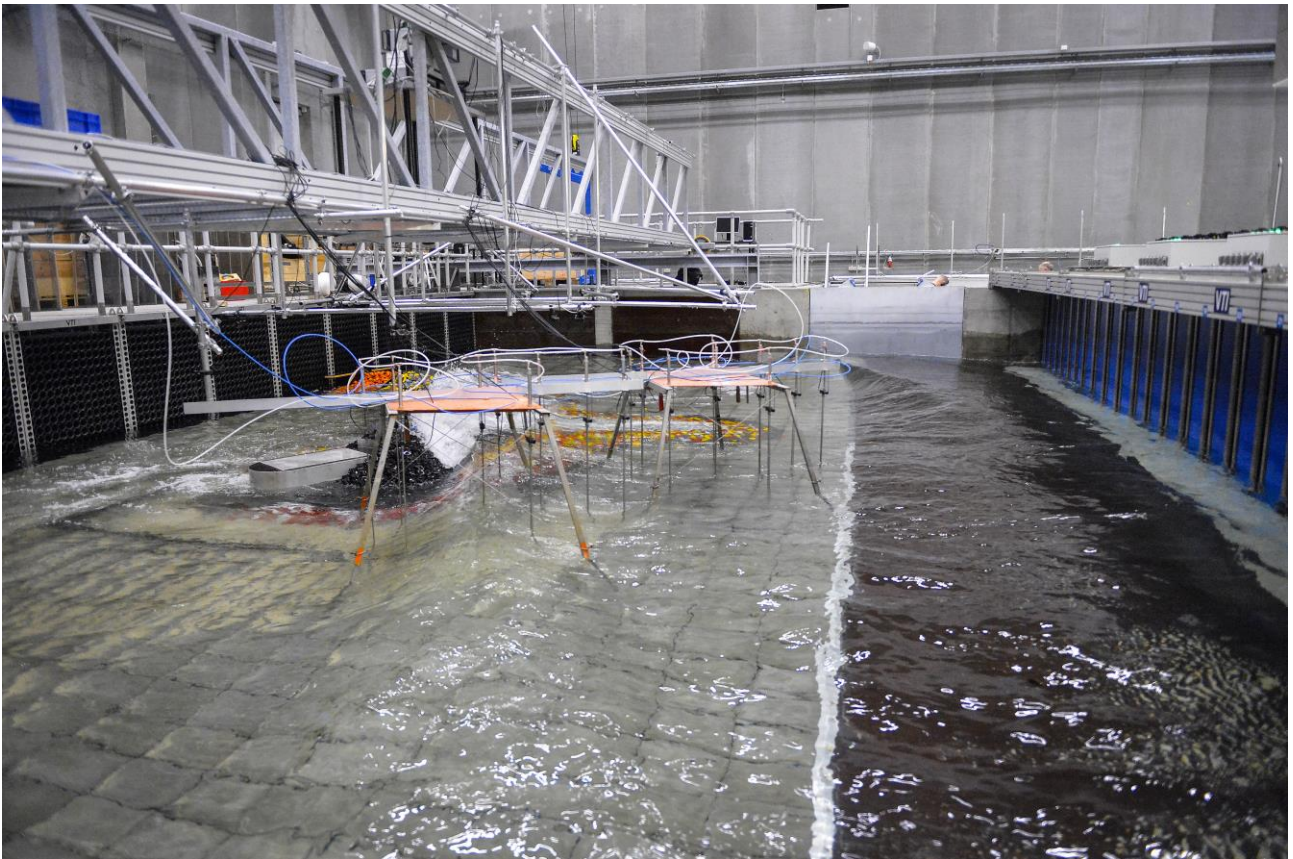
Testing of breakwater for Port of Hanstholm (19.01.2018).